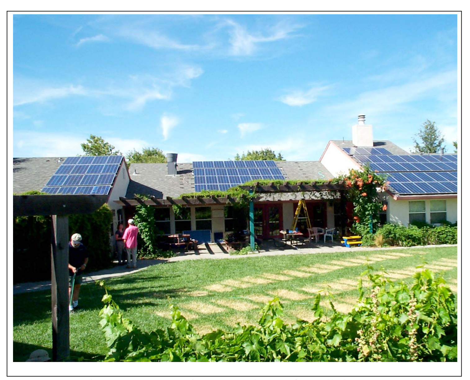
Muir Commons – Davis, CA - Solar Roof Installation (2003) www.muircommons.org